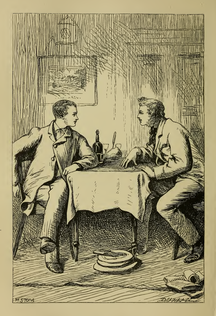
LECTURING ON CAPITAL.